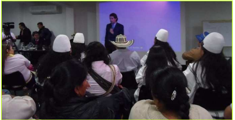
Day 5 national congress: Only the viceminister of Internal Affairs comes to listen to the conclusions of the congress...