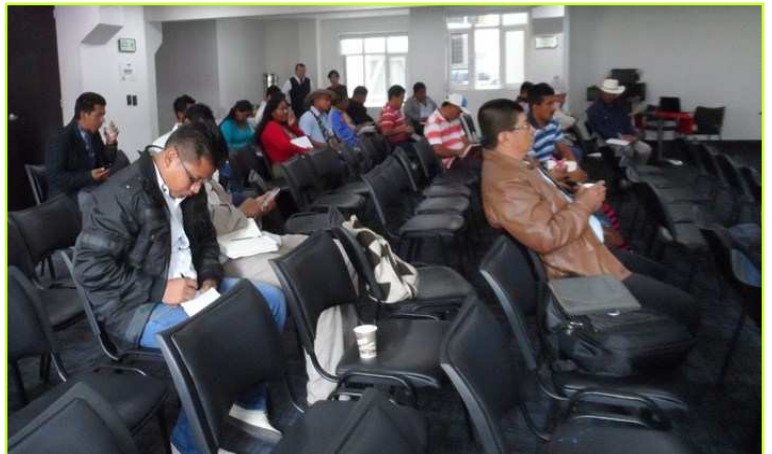
Day 1 national congress: Still some empty chairs...