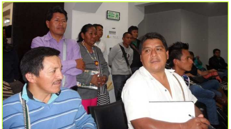
Day 2 national congress: Amazon Delegation on the background