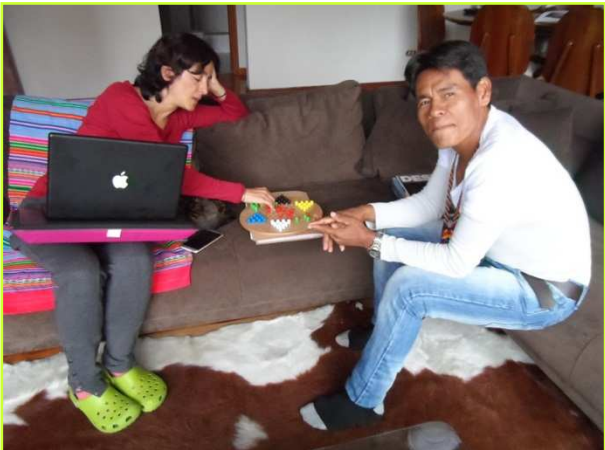
Day 4 Labour Day: A game of Chinese chess with a lady of the INCODER team while editing parts of the socio-economic study.