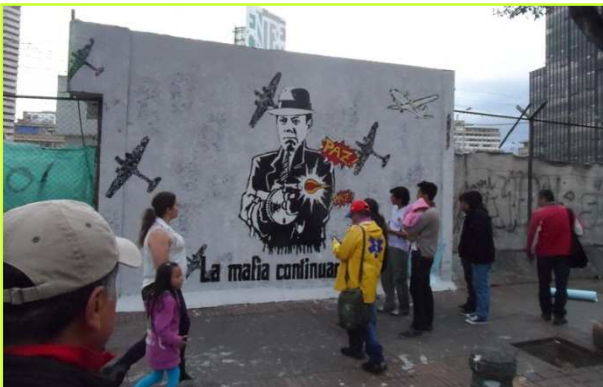
Somewhere on the street: Disagreement with the re-election of current president Santos because "the mafia will continue"...